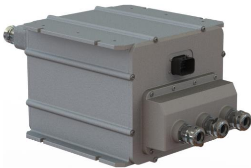
Drive Control Unit (DCU)