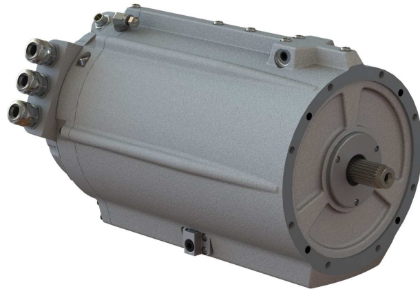
Electric Traction Motor